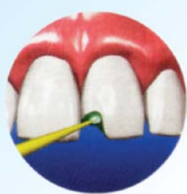
Fine size (1.5mm)