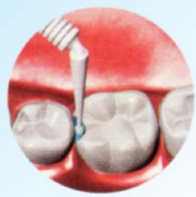
Superfine size (1.0mm)