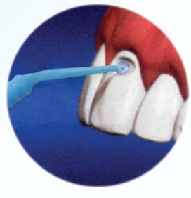
Regular size (2.0mm)